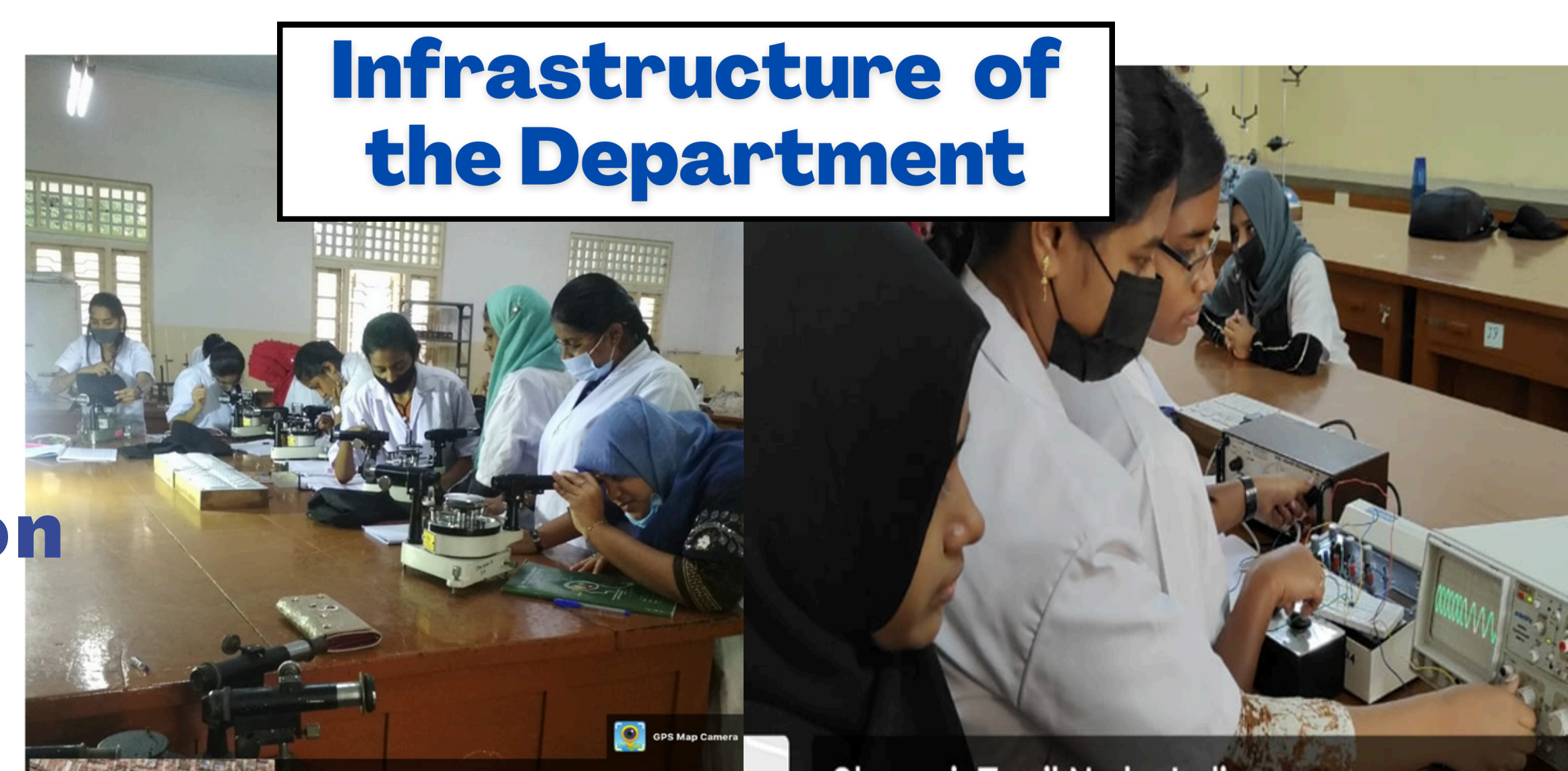
Infrastructure of the Department